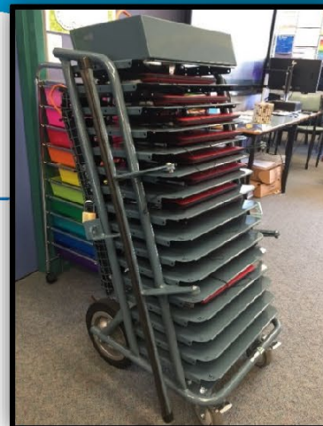
15x HP Laptops on the portable stand as a classroom bookable resource for the whole school