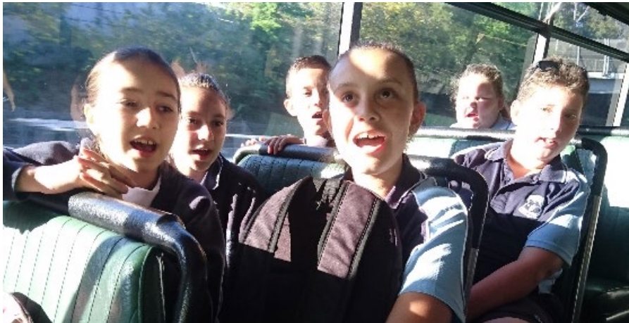
Singing on the bus.

On Tuesday, our choir went to the University of Wollongong hall and performed with five other school choirs at the Southern Illawarra Music Festival. We arrived at 7:30am and took a bus to the UoW. When we arrived we went up on stage to practise our individual songs, Rainbow Connection and Here with Me. After the other schools did their songs, we practised our mass choir songs. Then we were ready for the big show!